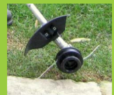
Line Head (N00BW-LH-10) Edging & Trimming