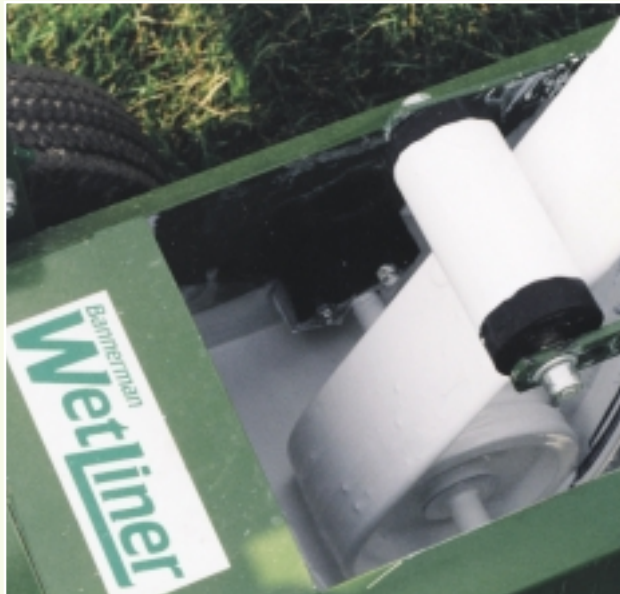
PSR-4 PAINT SAVER ROLLER