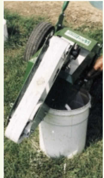
EASY TO DRAIN