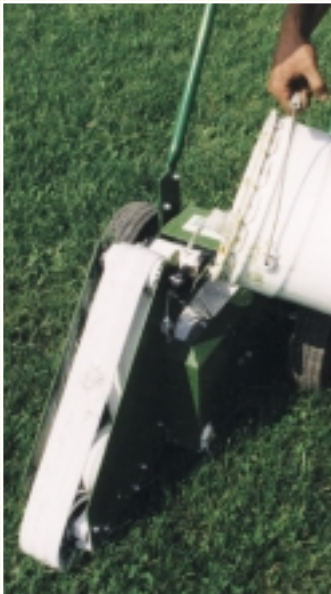
EASY TO FILL